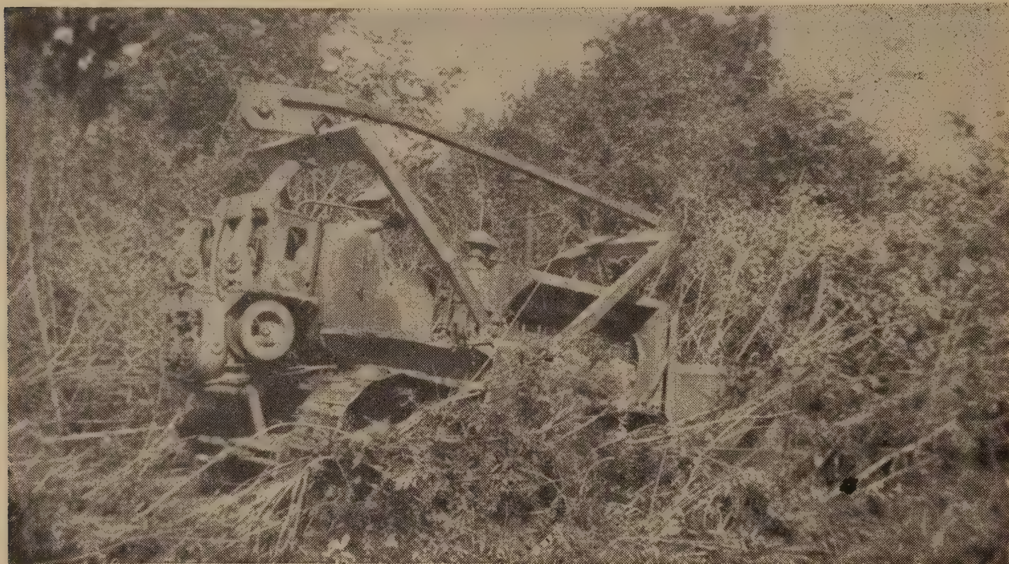
Virgin soil. How our field looked in March.

al. Florets have reached 8\frac{1}{2} inches in diameter. Even the tip buds are large and resemble a slender rose bud. Grows from 5\frac{1}{2} to 6\frac{1}{2} feet high. Flowers are well placed, and as many as 5 to 7 open at one time. The color is between La France and Geranium pink, soft, but very clear in tone. A magnificent big gladiolus that isn't in the least coarse. Splendid seed parent. Mid-season. No small bulbs or bulblets for sale. Lg. and med. only.